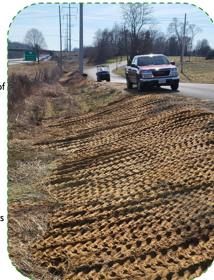
Grading rock harbor drive, above