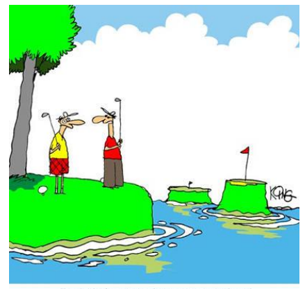
"I didn't say this course had a LOT of water. I said it was ALL water."