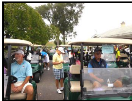
September 5: Members gather early in the morning to get ready for the Member Two-Person Chapman Scoring Outing.

These fundamentals of making a game plan is what low handicappers and tour professionals have been doing for many years and will continue to do. They know where to hit the ball and know where to miss it. If we all implemented this way of playing golf we would certainly lower our scores over time!