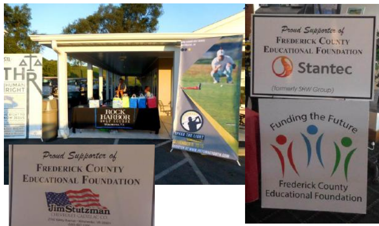
September 8: Potomac Youth Ministries Outing