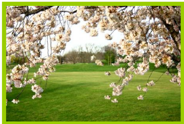
View from #1 Rock tee box.

start on The Boulder Course, which will last about a week also. You can expect that to begin during the week of April 11-16th. We also wanted to do our pre-emergent weed control on The Rock but the winds put a halt to that. Hopefully we’ll get some showers and good warm weather so The Rock greens can heal quickly.