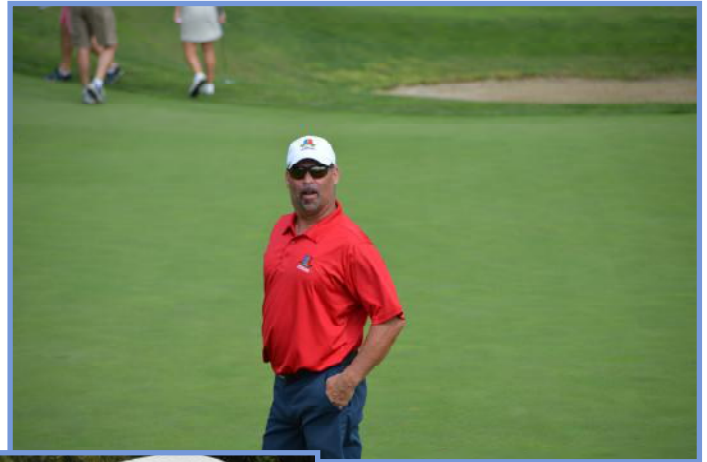
More Harbor Cup