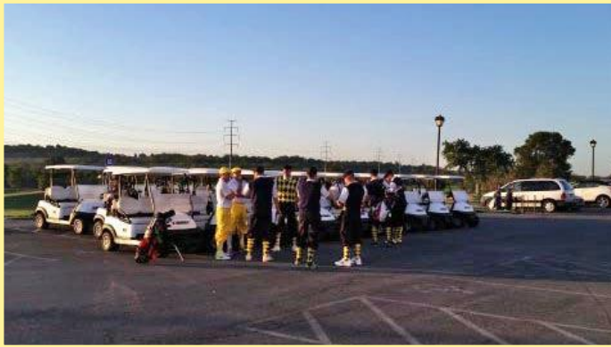
Friday, September 23, an early morning bachelor party.