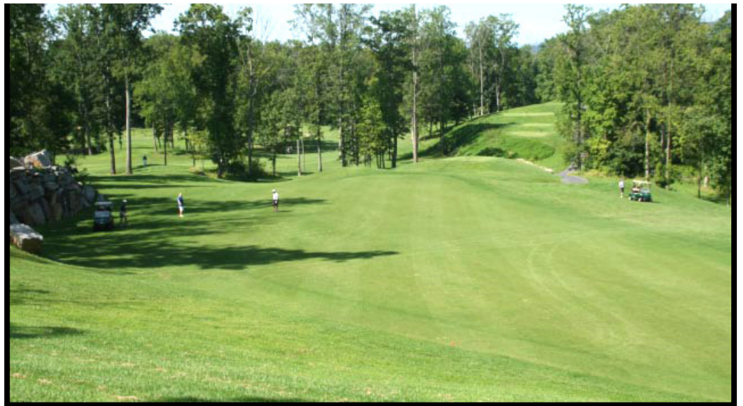
No. 7 Boulder looking West towards the tee boxes.

I'M HITTING THE WOODS JUST GREAT, BUT I'M HAVING A TERRIBLE TIME GETTING OUT OF THEM