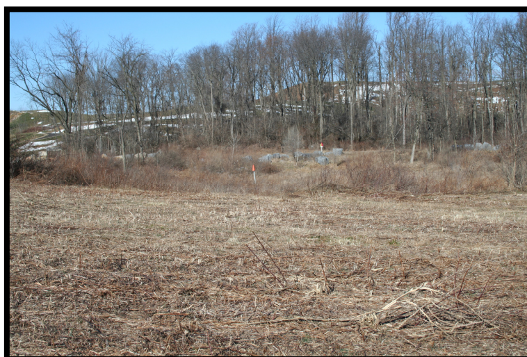
This picture was taken on January 8, 2014. Any guess what hole it is now?