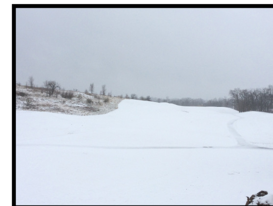
Rock #10 Snow Covered on March 20th

As always feel free to stop me anytime for questions, comments, or criticisms