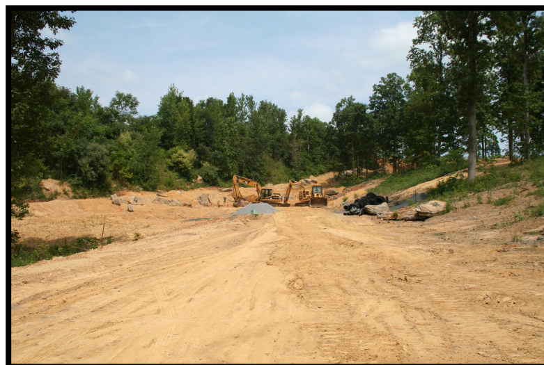
This picture was taken in August of 2014