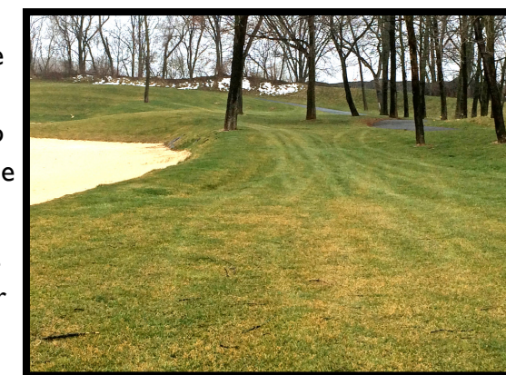
Cart Traffic at Rock #13 Green