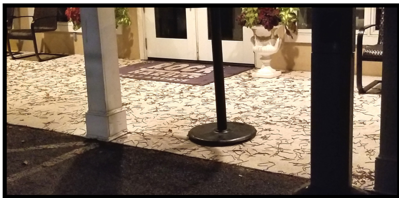
Worms on the Front Porch of the Clubhouse

One of the more fascinating occurrences from our wet season has been the emergence of thousands of earthworms on the parking lot and clubhouse front porch. The front porch has been covered at least a