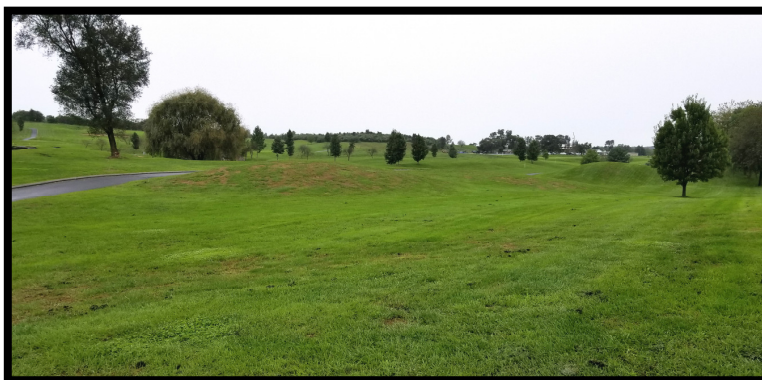
Rock #1 These bare areas are caused by diseases such as Brown Patch and Pythium, brought on by the wet conditions and the days it was 95+ degrees

This is the first time I can recall having to spray areas in the rough for disease. You may have noticed the brown areas in the rough, especially on Rock #1. (Picture right) These bare areas are caused by diseases such as Brown Patch and Pythium, brought on by the wet conditions and the days it was 95+ degrees. We will be seeding these areas over the next month. The one plus is we will be seeding more disease resistant varieties of turf. The costs involved with this year's disease pressure increased our chemical spending by almost 60%.