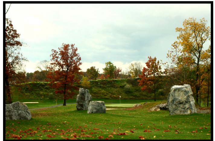
15 Rock in full fall bloom

As the temperatures drop and the colors of the leaves change, here are some of the things I love most about golf during the fall season.