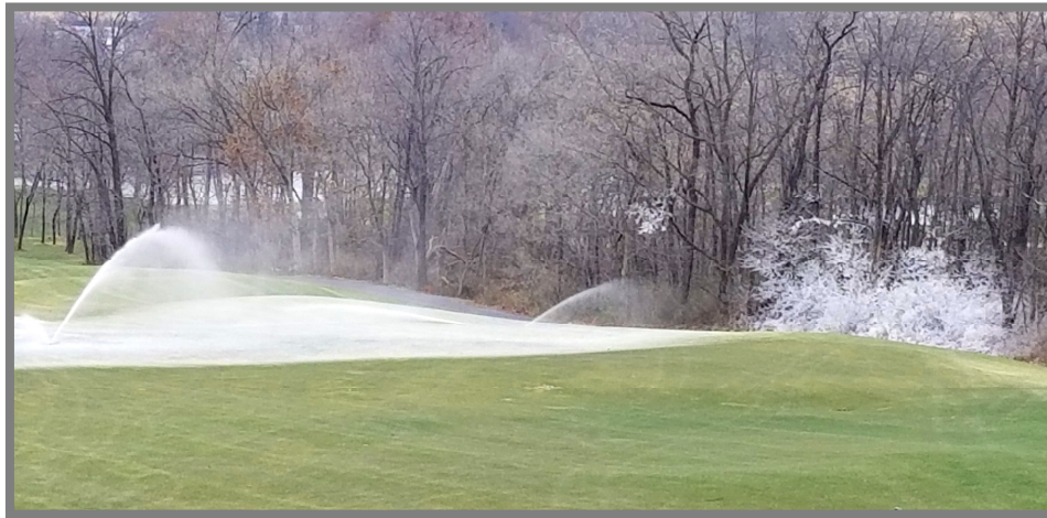
No. 16 Boulder, A Winter Wonderland

So while you may be thinking all is quiet at the golf course we have a lot of preparation first for winter then for spring. This week we are draining all the irrigation pipes, to include renting a large air compressor to blow the water out of the pipes.