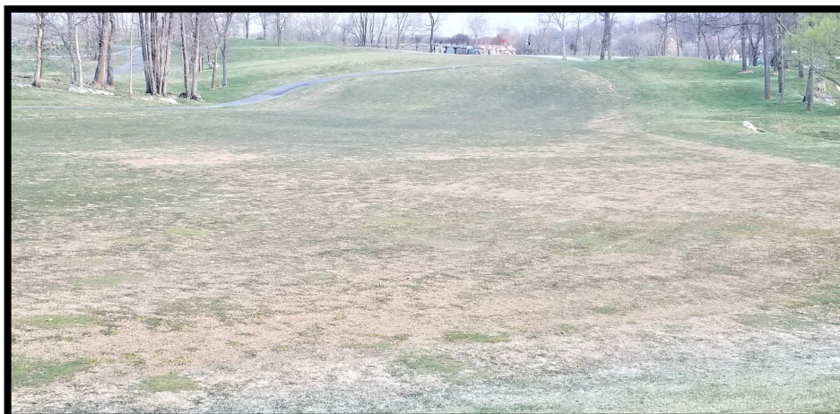
Number 6 Rock, Bare Areas

I have had a few questions about Rock #6 fairway, the right side. Rock #6 fairway had a high amount of kyllinga, a weedy type of nut sedge. Last fall we sprayed out the kyllinga, aerified, topdressed, and seeded the fairway. Unfortunately the extremely wet conditions prevented a good take on our seed. This month we will be re-seeding the bare areas on #6, as well as any other bare fairway areas we have due to past weather and/or elimination of large weedy areas. (picture Rock #6 Bare Areas, below)