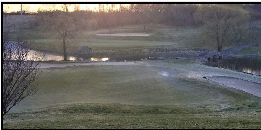
Number 10 Boulder, April 1, early morning frost

I am going to officially declare Rock Harbor a no frost zone. I am fed up with frost. As soon as we get a few warm days Mother Nature throws us a curve ball of night temperatures in the 20's. (picture below, on April 1) Unfortunately we have a few nights in the next couple of weeks our weather folk are calling for temperatures in the low 30's. Keep our fingers crossed and with some luck we won't get any more frost.