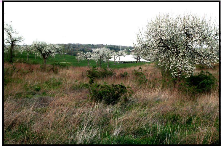
View of the Rock Harbor Apple Blossom tent from 2007. Happy Apple Blossom!

To subscribe or unsubscribe to this free newsletter send an e-mail to mistyautumn@comcast.net Questions/Comments or Suggestions welcomed