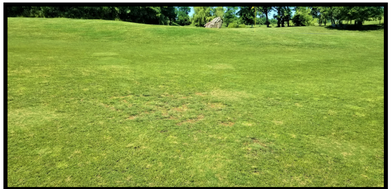
Rock #6 Fairway before seeding begins.

In the next two weeks, we will be reseeding Rock #6 fairway. The process will begin by spraying all the weeds out of the fairway. The entire hole will be roped off from cart traffic. We will then heavily aerify the fairway, followed by seeding. It will be necessary to run some sprinklers during the day to keep the seed moist. The hole will not be taken out of play, so please take your divot bottle out to fix your divots.