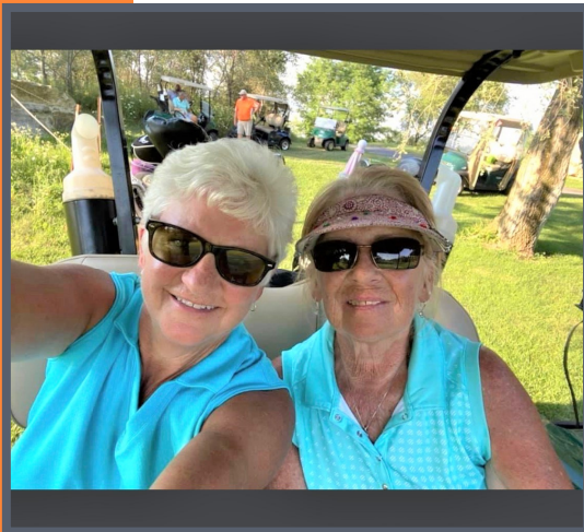
Snapshot from Member/Member

As we continue with these busy days, please help us accurately track rounds and ensure proper billing by checking in with the golf shop before your round. We love to see everyone before your round as it is important for us to know who is on property.