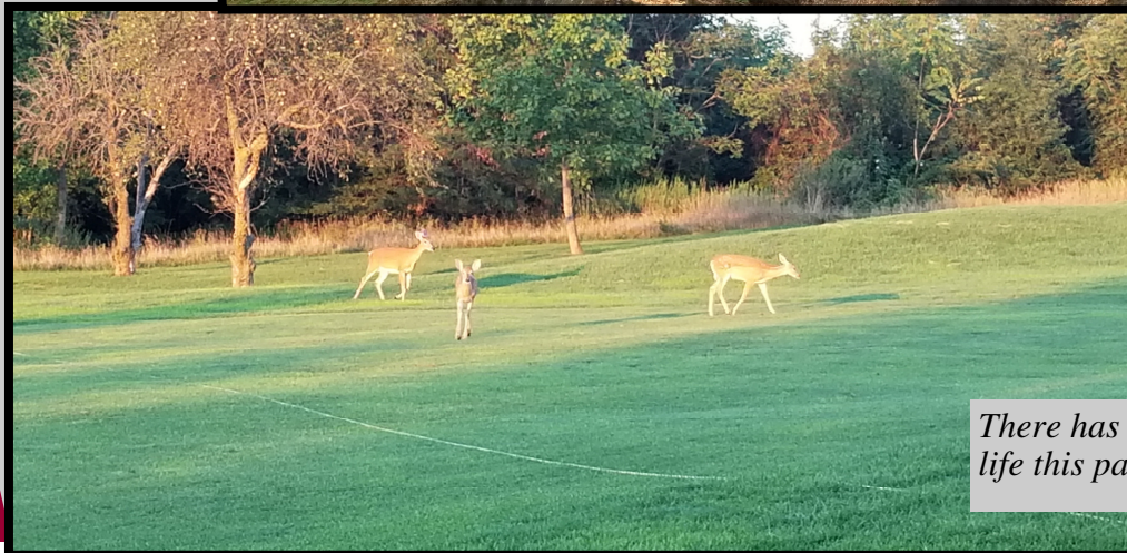
There has been plenty of course wild life this past year.