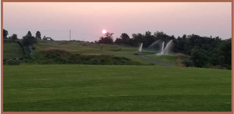
Boulder 3: Sunrise and Sprinklers