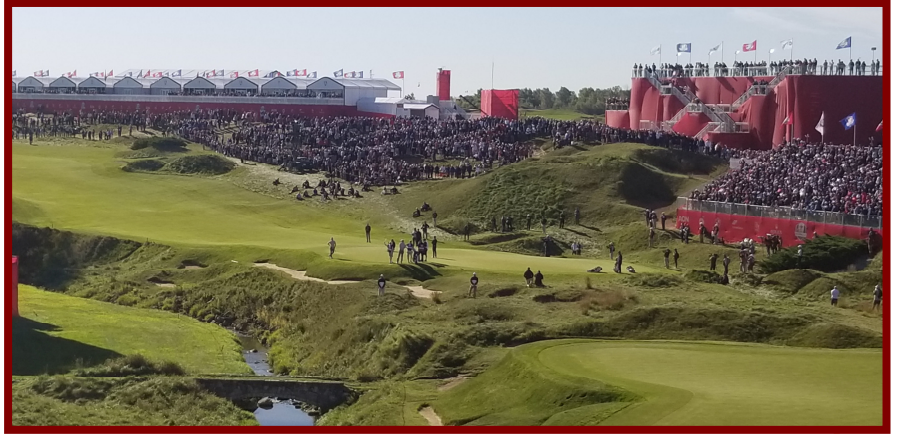
Whistling Straights Golf Course, home of the 2021 Ryder Cup

To subscribe or unsubscribe to this free newsletter send an e-mail to mistyautumn@comcast.net Questions/Comments or Suggestions welcomed