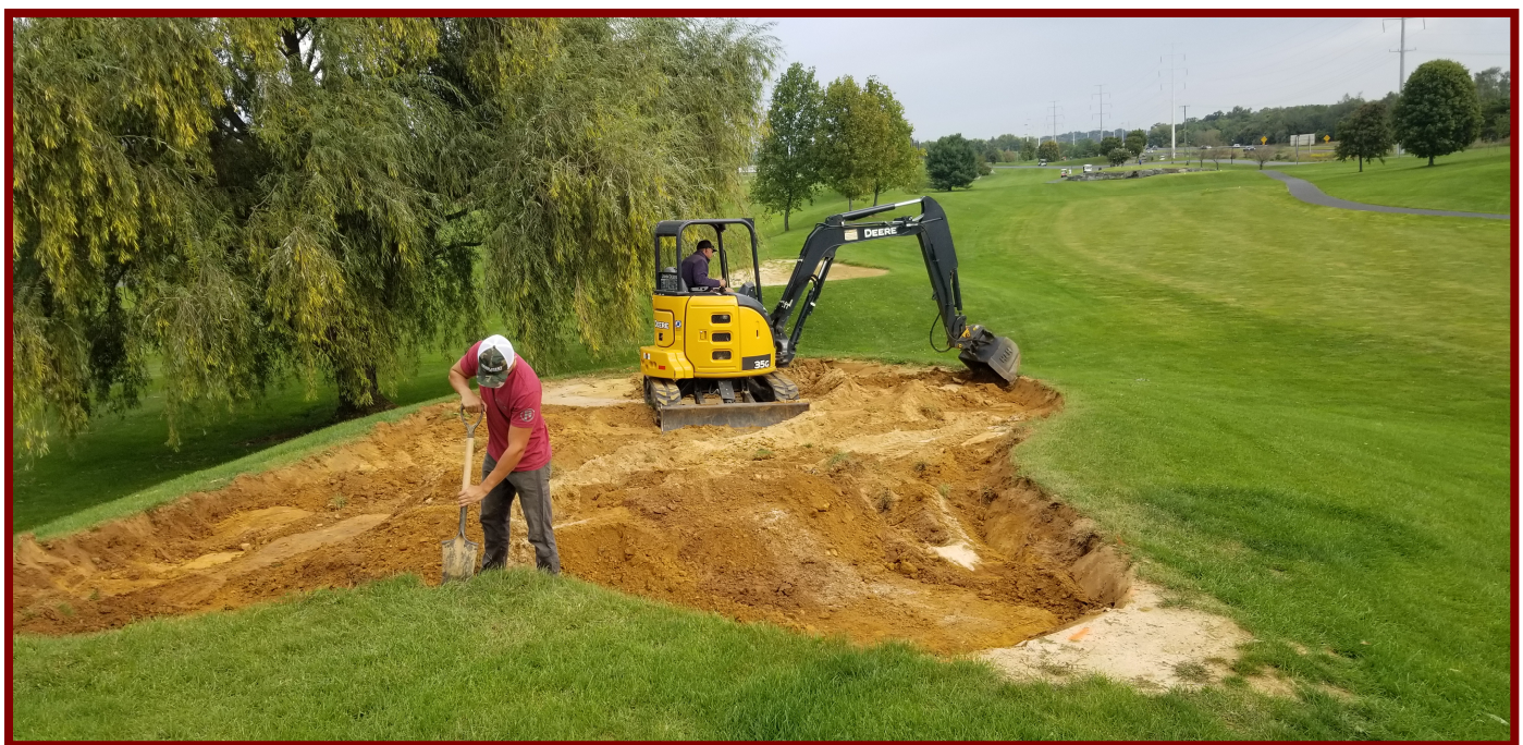
Bunker renovations continue on Rock 1.

As always, feel free to stop me for compliments, criticisms, or to just say hey. 3