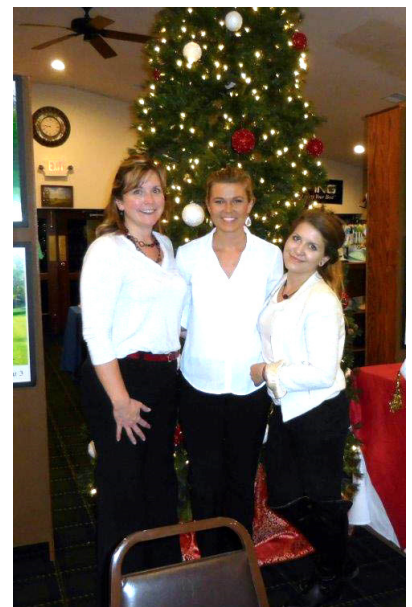
Some of our staff from Christmas 2016 pause for a photo in front of the tree.