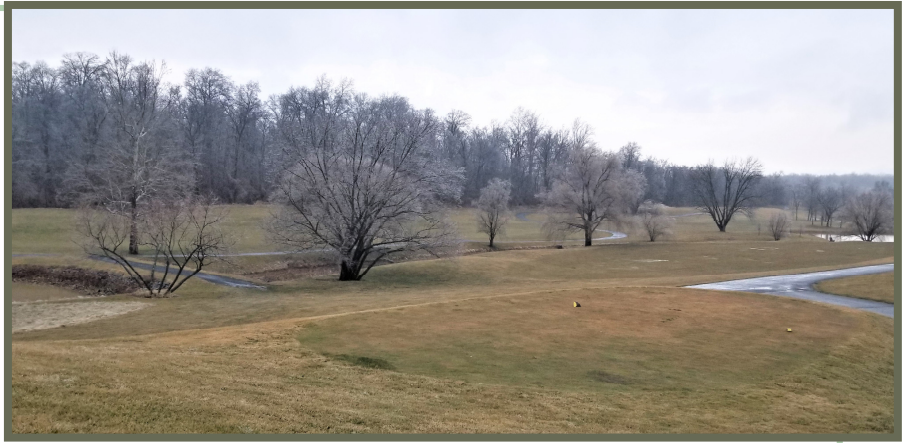
Boulder 10, ice covered.

To subscribe or unsubscribe to this free newsletter send an e-mail to mistyautumn@comcast.net Questions/Comments or Suggestions welcomed