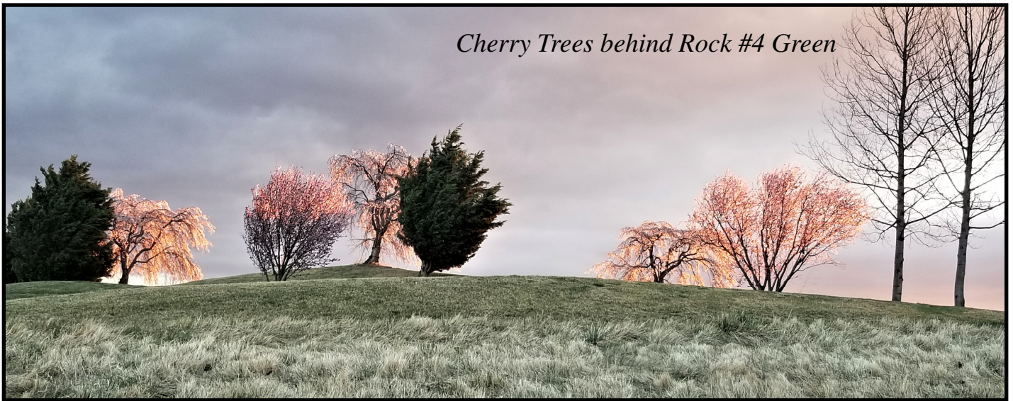
Cherry Trees behind Rock #4 Green

Well winter was over and then it wasn't. March started with some wonderful weather. Everything started blooming. We mowed fairways, greens, tees, and some of the rough. Then the end of March we got temperatures in the 20's and the greens froze enough we could not move the holes. The weather in the Mid-Atlantic will always throw a curve ball.