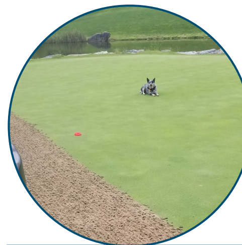
Cali assisting with the aerification of Boulder 16, pictured above.

growing, as well as letting water and nutrients infiltrate into the soil. The Boulder Course had a few greens finish a little rougher than the others. A lot of movement in the turf gave several greens a wavy look. We will be doing some heavy rolling in the upcoming week to smooth/true the surface. In the next month we will be overseeding a few of the fairways and spreading a light dose of compost.