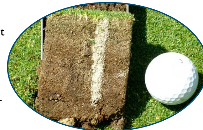
Cross section of aeration holes, filled with sand top dressing, pictured above.

This should have little disruption to your game since most of you play in the rough!