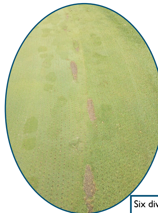
Six divots on Boulder 12, pictured left.

It is always nice to have your input so please stop me and let me know what you think.