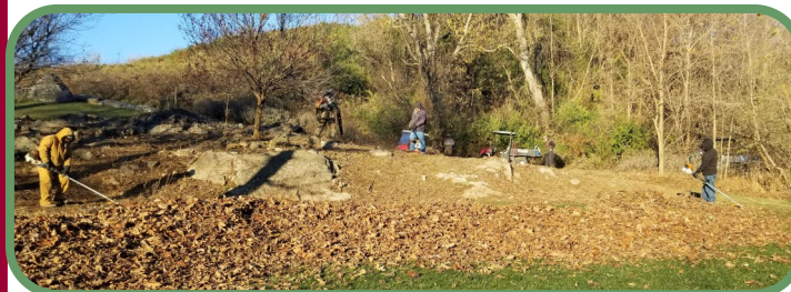
Boulder #2 Bunker redesign pictured below.