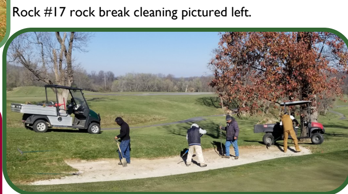
Boulder #15 Bunker edging pictured above.