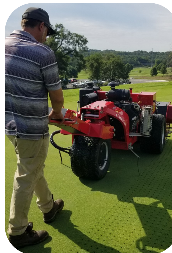
Aerifier, pictured above.