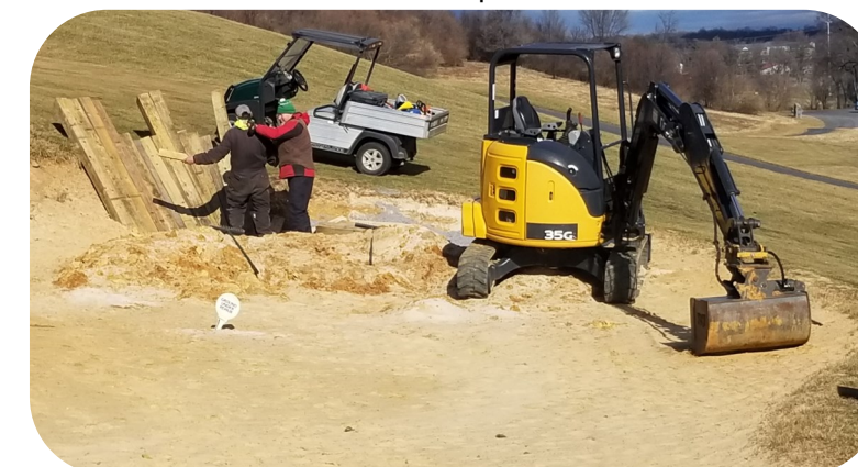
Boulder #2 Bunker, pictured below.

For questions, comments, or criticisms stop me anytime.