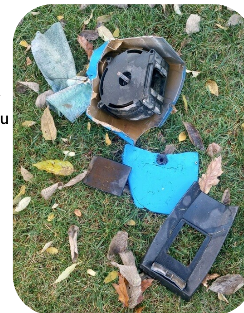
Smashed ball washer, pictured above.

I would like to thank the ownership for our recent purchase of a New (not used) Aerifier, which should be arriving in early April, and also for the purchase of an updated irrigation control package. Both are substantial investments in our courses.