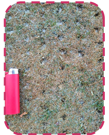
Aerification 1-inch spacing, pictured above.

⇒ We got done at a faster pace for two reasons. Normally, we run the aerifier to pull a core on 1-inch spacing. When our new aerifier had not arrived I made the decision to change the spacing to 2.5 inches. This change makes the aerifier run at 1.5 times faster, however it decreases the benefits we get out of aerification. Losing some of the benefits is acceptable every once in a while. With the decrease in the number of holes, the amount of debris we need to remove from the greens is significantly less and it's less time we have to cleanup.