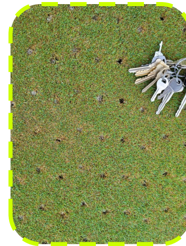
Aerification 2-inch spacing, pictured above.

⇒ We got done at a faster pace for two reasons. Normally, we run the aerifier to pull a core on 1-inch spacing. When our new aerifier had not arrived I made the decision to change the spacing to 2.5 inches. This change makes the aerifier run at 1.5 times faster, however it decreases the benefits we get out of aerification. Losing some of the benefits is acceptable every once in a while. With the decrease in the number of holes, the amount of debris we need to remove from the greens is significantly less and it's less time we have to cleanup.