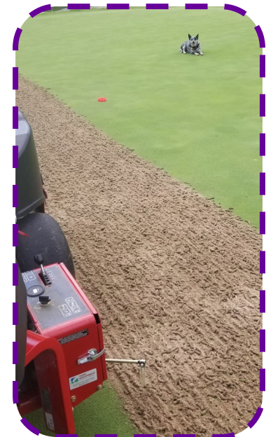
1-inch spacing debris, pictured above.

⇒ The amount of sand seems less because less holes equals less sand showing. The dry conditions at the time of aerification also helped with the sand. Dry sand sweeps up a lot quicker than damp or wet sand. The last step to early opening is we didn't aerify tees due to the dry conditions. So, now that you know my secrets, do not expect the same next year, as you never know what tomorrow will bring.