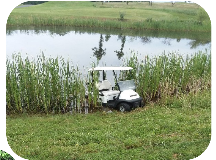
Pictured above, cart in pond on Rock #11

The rain has finally arrived, and a good, soaking rain it is. The change in moisture conditions will change how the course plays. Your drives will not roll as far, and the greens will roll a little slower. Golfers should be attentive to the fact that higher moisture in the soil means ball marks will be more prevalent and pronounced. Moisture will also make divot peel out larger and easier. Hill sides may become slicker than what we are used to, so be careful.