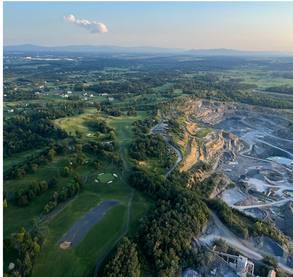
Hot Air Balloon aerial view of our Course, right next to our Quarry, pictured left.

Subscribe or unsubscribe by sending an e-mail to therock@rockharborgolf.com