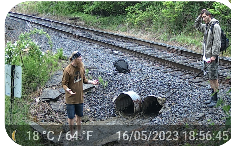
Fishing Buddies, pictured above.

Finally, MEMBER/GUEST seemed to be enjoyed by all. Hold for a little bit of stormy weather at the beginning, things ran pretty smooth.