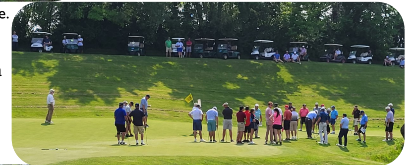
Pictured above and left, shots from the MEMBER/GUEST Tournament.

Finally, MEMBER/GUEST seemed to be enjoyed by all. Hold for a little bit of stormy weather at the beginning, things ran pretty smooth.