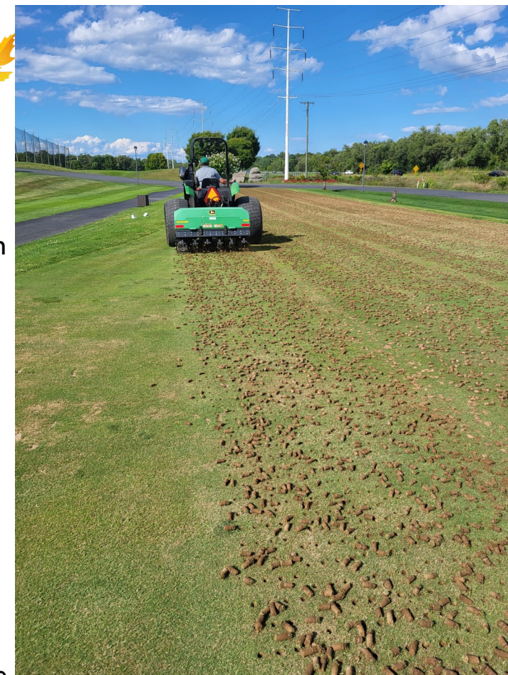
Aerifying Rock 1 tee, pictured above

It has been good to see everyone enjoying the course this year. Please, feel free to stop me for questions, compliments, criticisms, or just a hello.