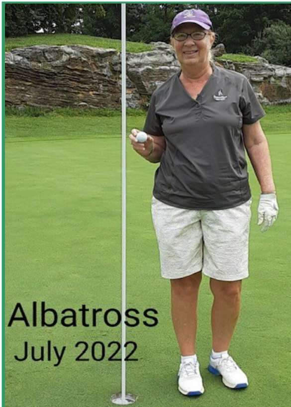
Albatross July 2022

get-together. Hopefully, you'll enjoy them! I posted some signs around the grill asking that Members close their tickets out prior to leaving the course. We've had several disputes on the charge accounts, and if you close your tickets out prior to leaving we will not have this problem. Keep this in mind before leaving the course, or I'll have to go through each purchase you make.