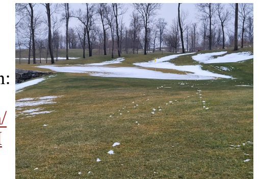
Melted snow on Boulder #13

Remember to fix your ball marks and divots!