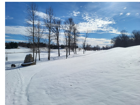
Snow on Rock #5

Here are a few snowy golf course pictures. You can see what you missed on the course.