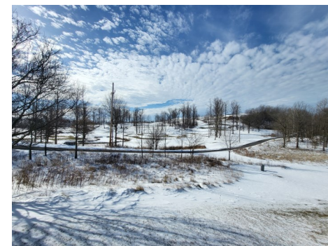
Snow on Boulder #9/Rock #17