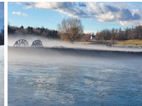
Fog and ice on Rock #7