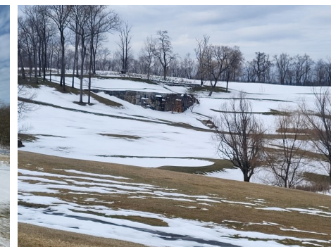
Snow on Boulder #13