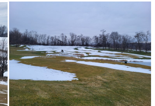
Melting snow on Boulder #17