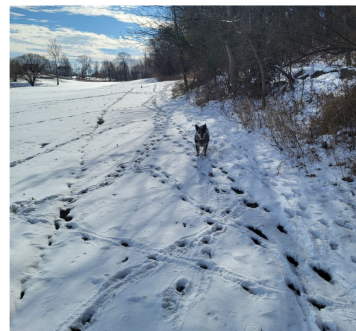
Cali in the snow!

Here is a link you can check out for some entertainment or education: