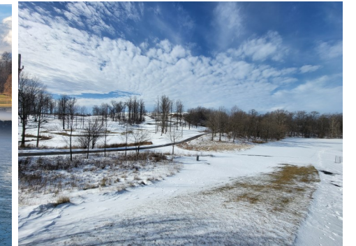
Snow on Rock #17