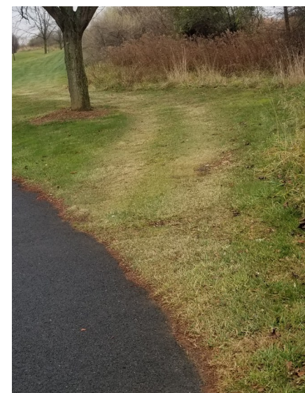
Boulder 18 cart traffic

Bare spots along paths are more than just a problem for the maintenance team, they also create bad lies that can make a mess of your scorecard. It's no fun trying to hit a delicate chip onto the green from a bare dirt lie near a cart path. The Rules of Golf only allow for relief from these areas if they're marked or otherwise defined as ground under repair, or the path directly interferes with your stance or swing. That means there's a decent chance you're playing from the dirt if you're unlucky enough to end up there.