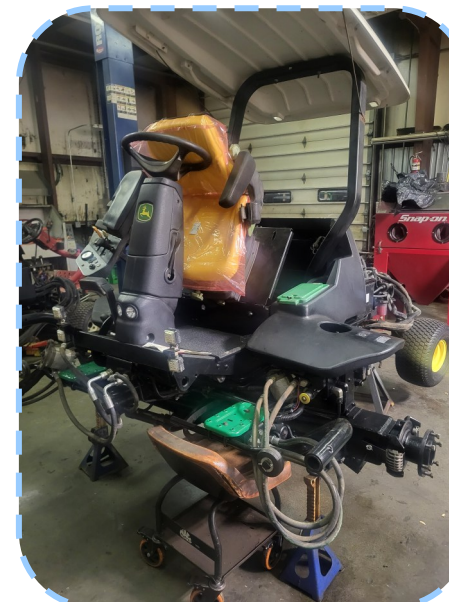
Fairway mower rebuild, above.

As we continue into winter, our projects continue. We recently cleared the area between Rock #15 and #16, pictured left. The stripped down fairway mower is coming together nicely and Fred has started into 3245 rough mower and rebuilding the second tractor. We have done most of the bush hog work in the no-mow areas. We will be cleaning