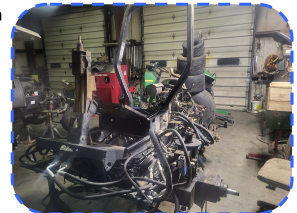
3245 strip down, above. Tractor disassembly, below.