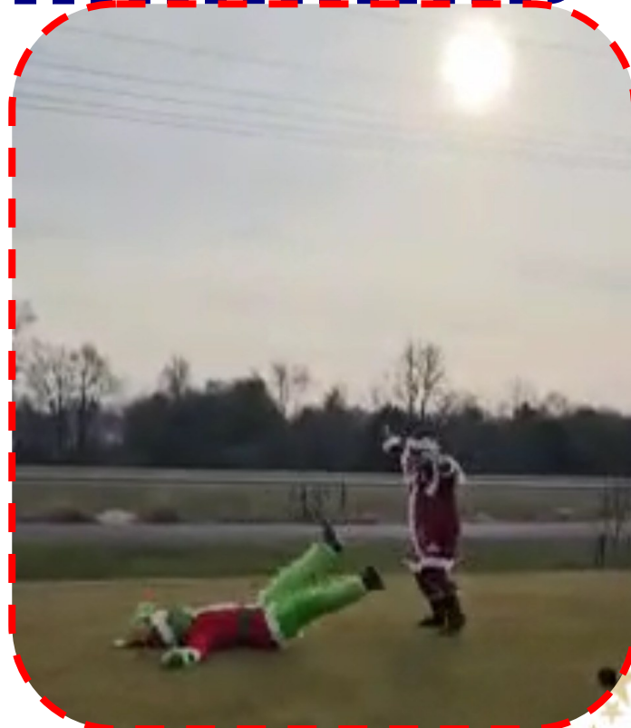
In a battle of holiday spirit, Santa proves once again that Christmas is saved!

To subscribe or unsubscribe to this free newsletter, send an e-mail to: therock@rockharborgolf.com