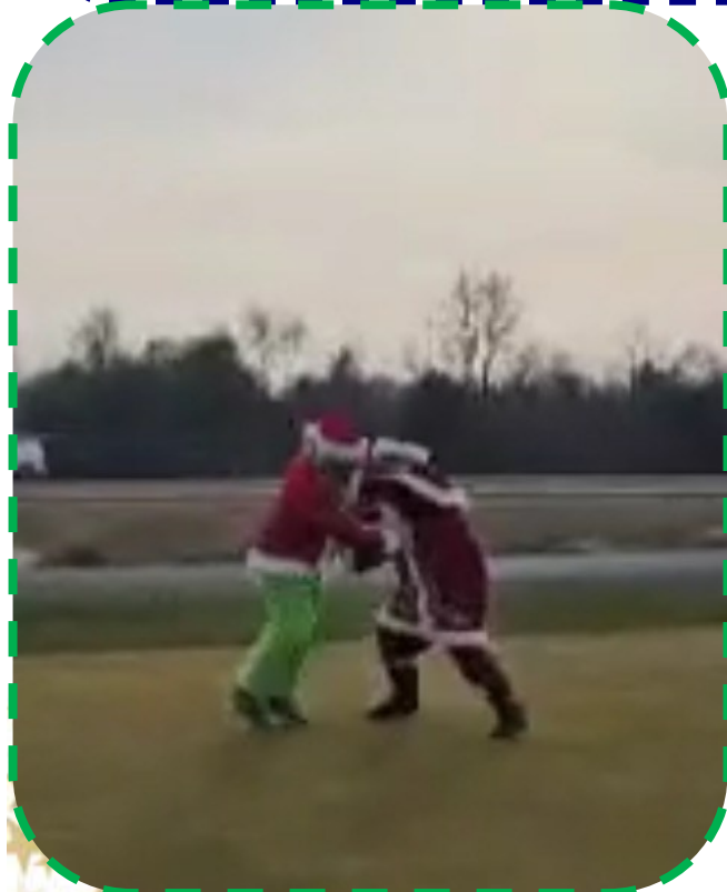
Santa vs. The Grinch: Who knew saving Christmas could be this entertaining?